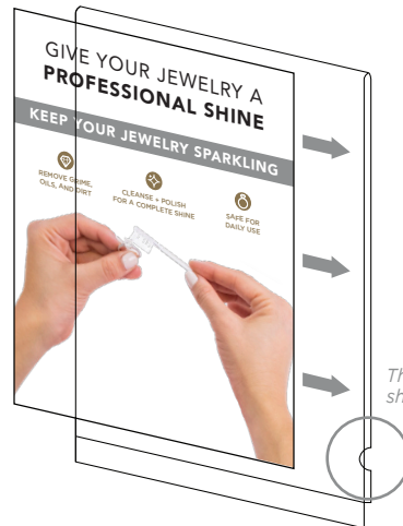
Signage Orientation in Holder

Note: There is room to keep back stock of extra product underneath the top shelf.